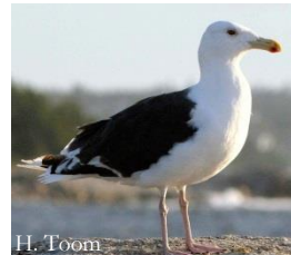
Great Black-backed Gull (resident)