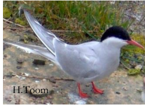
Arctic Tern (breeder)