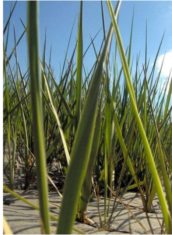
Beach Grass (marram)