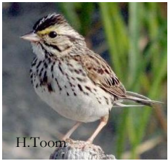
Savannah Sparrow (breeder)