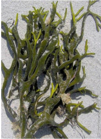
Dead Man's Fingers (Codium) – invasive