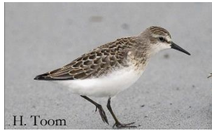
Semipalmated Sandpiper (migrant)