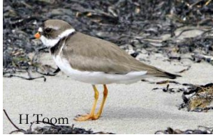
Semipalmated Plover (migrant)