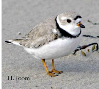
Piping Plover (breeder)