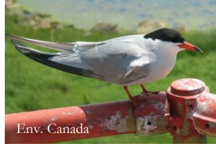
Common Tern (breeder)