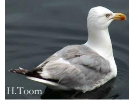
Herring Gull (resident)